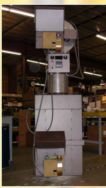
Model P16 Rear