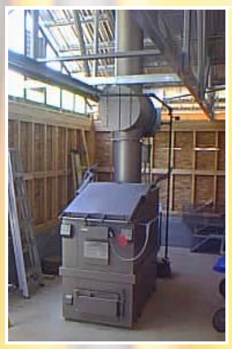
Model P16 Front

The P16 is designed to burn Type IV pathological waste and infectious and contaminated "red bag," surgical dressings, plastic test devices and other wastes. If you are paying a high fee to haul these waste materials to a disposal site, now is the time to consider the on-site Incineration alternative .