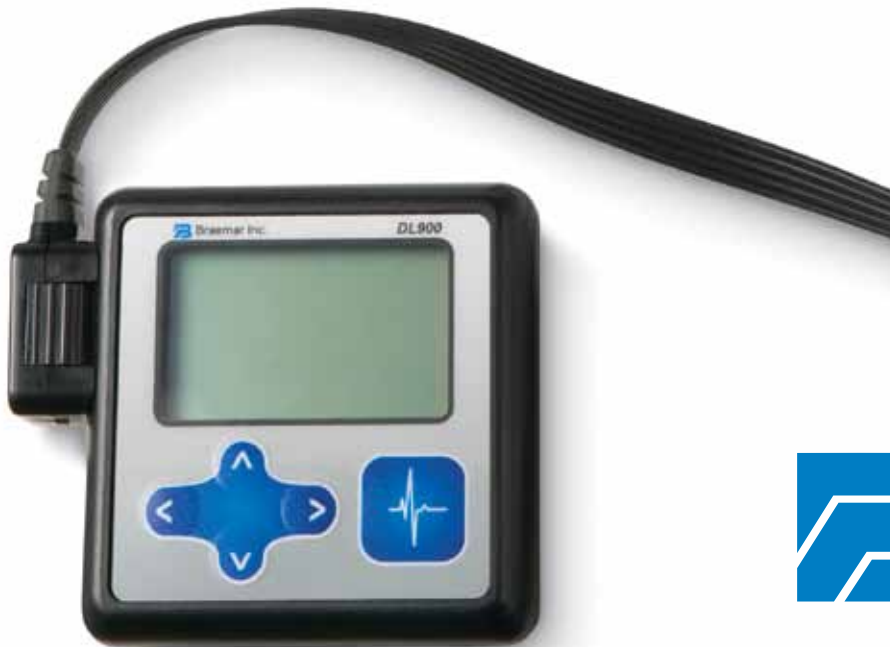
Actual Size Shown